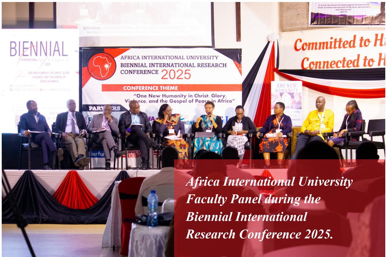
Africa International University Faculty Panel during the Biennial International Research Conference 2025.

The conference had a busy schedule, with 3 faculty sessions, 2 partner panels, and 15 breakout rooms arranged in inter- and trans-disciplinary formats. Organization that aimed at ensuring the quality and organization of the conference.